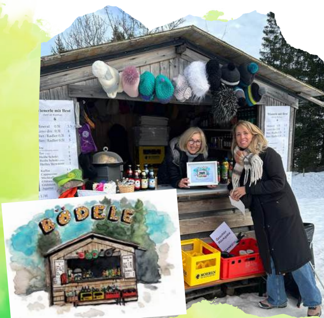
A farewell gift for a special place (2025)

I'm excited to see what beautiful projects and special encounters lie ahead! 🌈