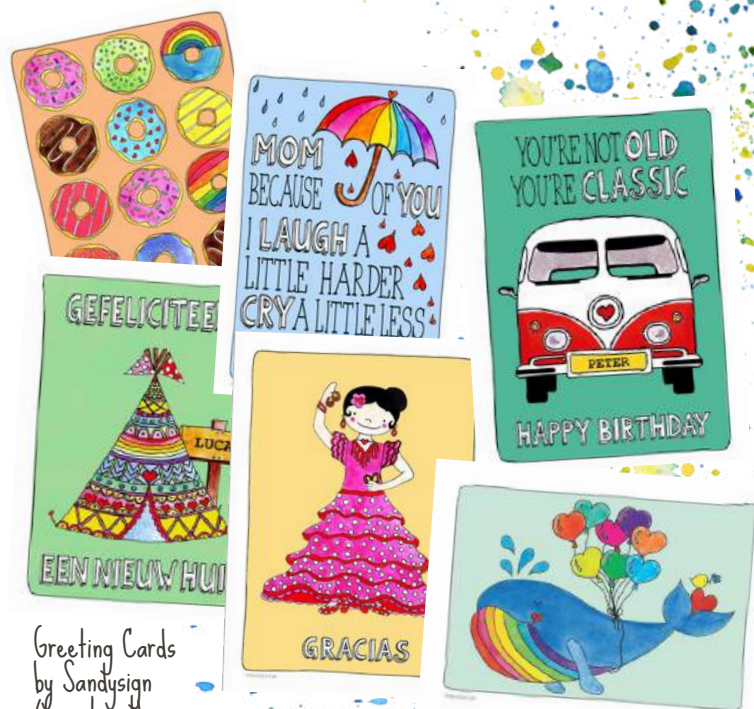
Greeting Cards by Sandysign (Greetz.nl)

Another memorable moment was when a friend asked me to create illustrations for a fundraiser for Stichting Care4Tina. She had adopted a son with a cleft lip and traveled to China to support the foundation.